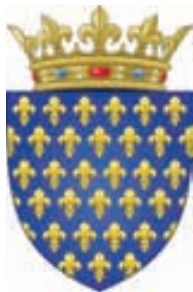
Coat of Arms of King Louis IX